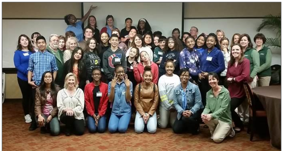
In late March, Longwood Gardens hosted the Futures AHEAD camp for our Coatesville, Phoenixville and Kennett Square middle school students.